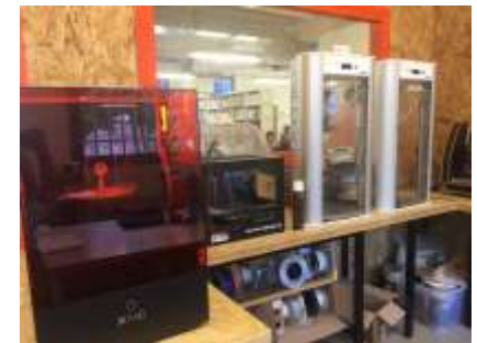
3-d printers (plastic)