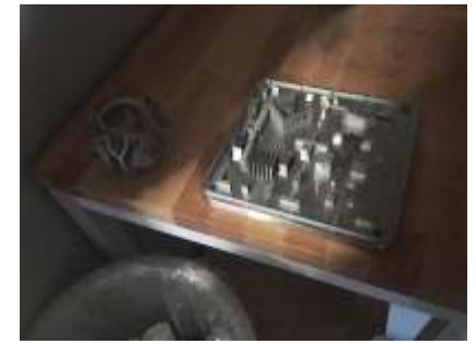
3-d printers (steel)