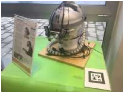
Oculus rift and other augmented reality objects