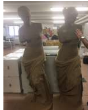
3-d printers (cardboard)